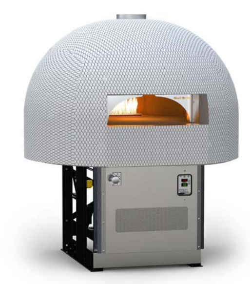
WS-TS-5-RFG-IR model with standard arch shown.