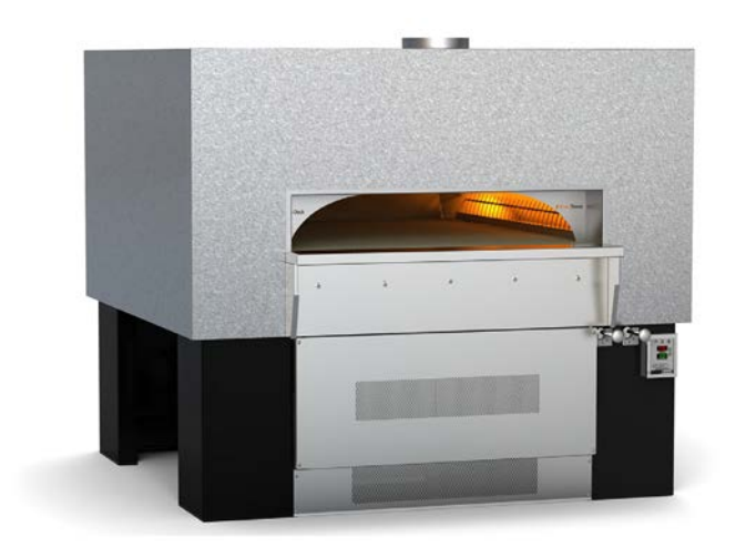
WS-FD-9690-RR-IR configuration shown.